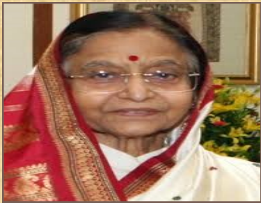
Hon. Sau. Pratibhatai D. Patil Former President of India & Founder of the College