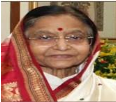
HON. SAU. PRATIBHATAI D. PATIL FORMER PRESIDENT OF INDIA & FOUNDER OF THE COLLEGE