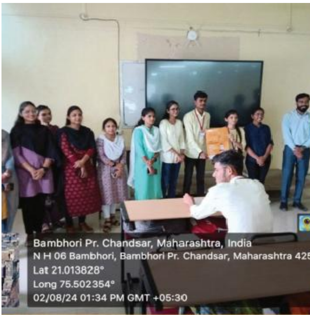
Bambhori Pr. Chandsar, Maharashtra, India N H 06 Bambhori, Bambhori Pr. Chandsar, Maharashtra 4250 Lat 21.013828° Long 75.502354° 02/08/24 01:34 PM GMT +05:30