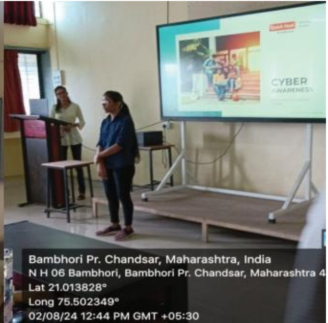
Bambhori Pr. Chandsar, Maharashtra, India N H 06 Bambhori, Bambhori Pr. Chandsar, Maharashtra 4 Lat 21.013828° Long 75.502349° 02/08/24 12:44 PM GMT +05:30