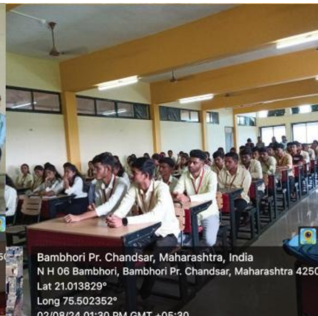
Bambhori Pr. Chandsar, Maharashtra, India N H 06 Bambhori, Bambhori Pr. Chandsar, Maharashtra 4250 Lat 21.013829° Long 75.502352° 02/08/24 01:30 PM GMT +05:30