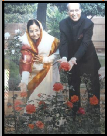
Smt. Pratibha Tai Patil